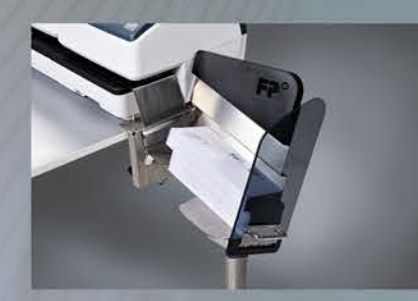
PostBase Ten offers many additional options

Exceptional PostBase Ten, with up to 110 letters per minute in non dynamic mode, accounting, software reporting, Wi-Fi option and many other features. Simple and accurate to use. Technology plays a major part in our working lives and PostBase Ten is designed specifically for business.